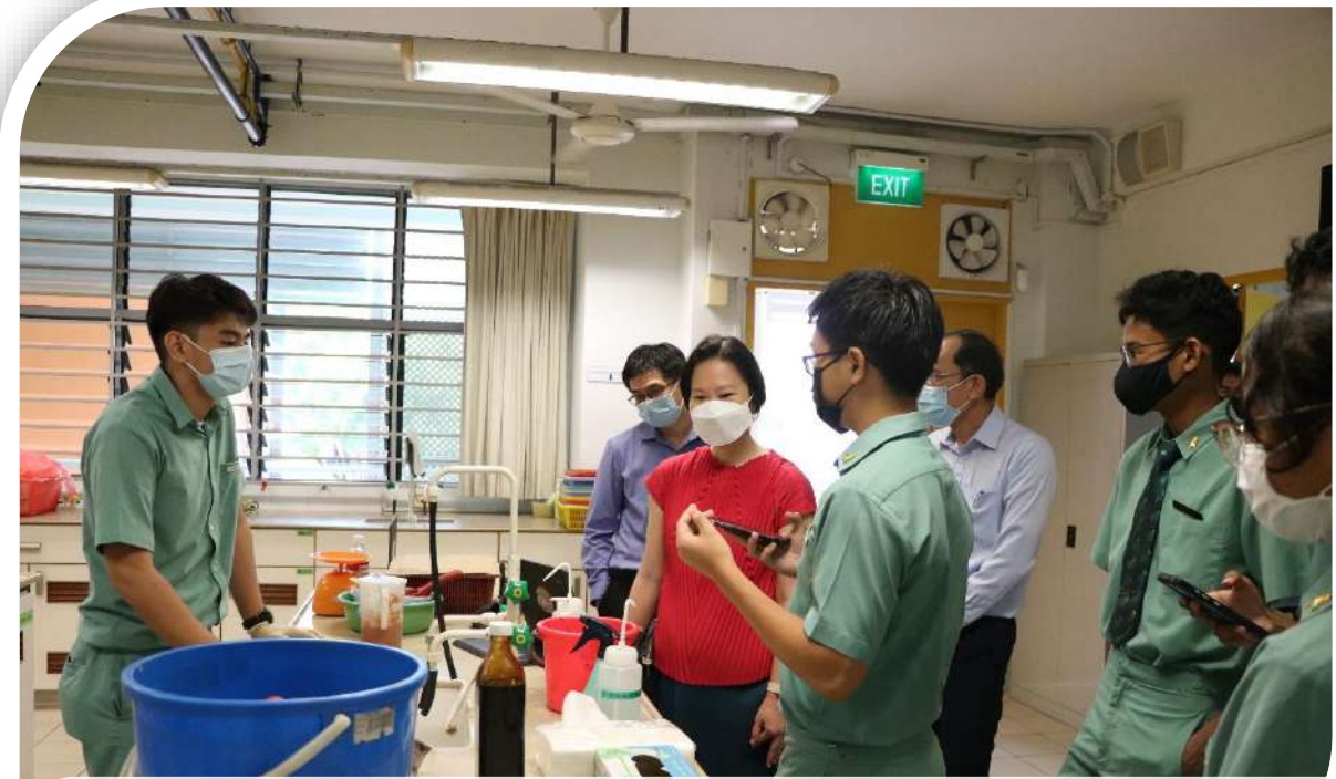
Visit by Minister of State (MOE)