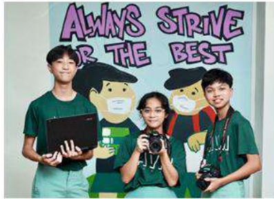
AV & Media Club