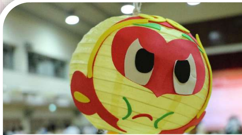
Mid Autumn Festival