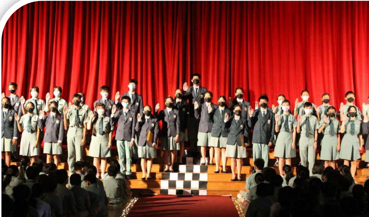
Student Leaders Investiture